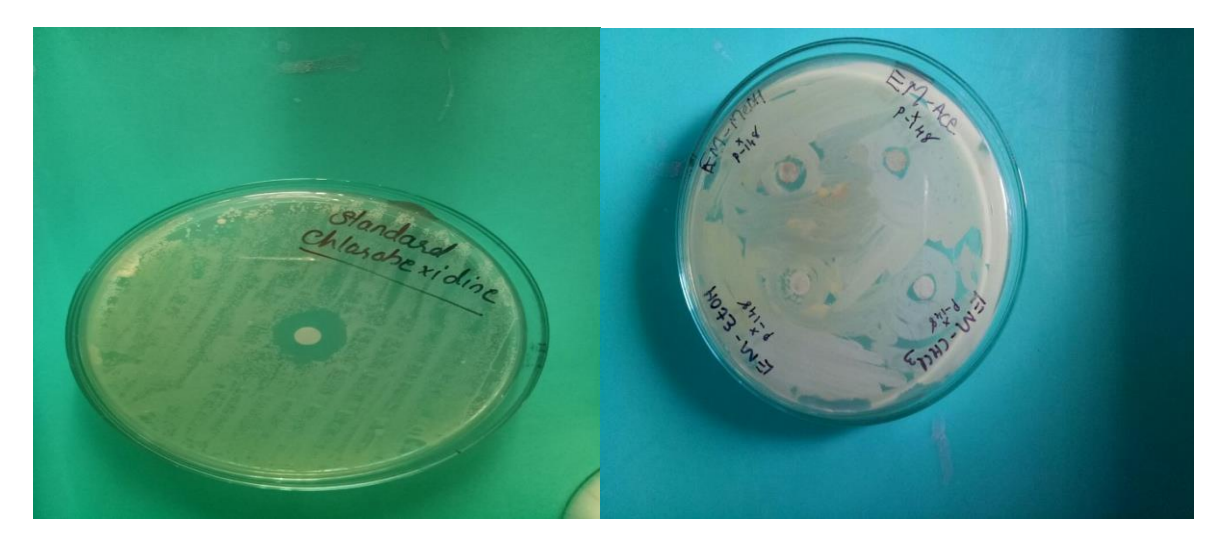
Table 1: Zones of inhibition of four different extracts on salivary samples in mm